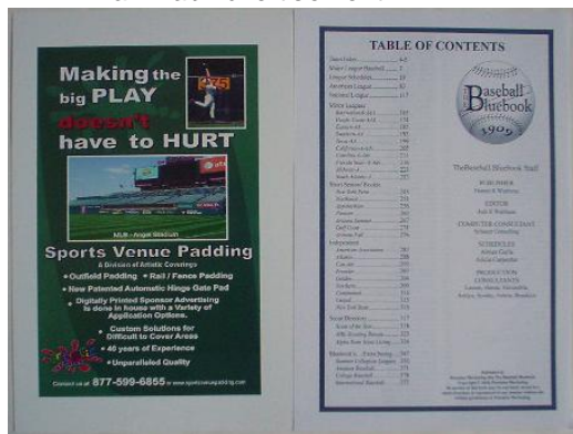
Main Tab Advertisement